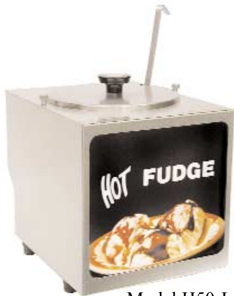
Model H50-L (Warmer w/Ladle)