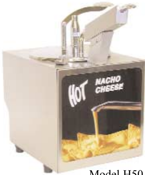
Model H50-HS (Warmer w/Heated Spout)

Each unit comes complete with an on-off switch, a lighted panel, attractive graphics, and 6 ft. cord and plug for easy installation. Powered by a powerful 400 watt wrap around heating element, it provides evenly distributed heat to the entire unit. Cecilware's Hot Condiment Dispensers are an exceptional value for your everyday foodservice operation.