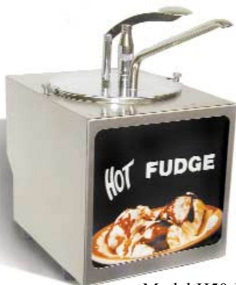
Model H50-P (Warmer w/Pump)

Compact in design, these units save valuable counter space. The lighted panel along with colorful graphics will surely put focus on your merchandise and stimulate sales.